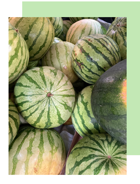
Donated watermelon that went to a local mutual aid group from the Jersey Shore

Our programming continued to expand in California with the passing of SB-1383, as well as Rhode Island, New Jersey, Massachusetts and beyond. It was a truly a year of magnitude, success and growth.