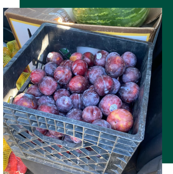
Produce recovered in Oakland and donated to Unity Within the Communities, Inc.

39,519pounds of food and supplies<br/>donated in Oakland51,025pounds of food moved for the<br/>Service To Soul Program>7,500,000pounds of food recovered in<br/>California in 2023