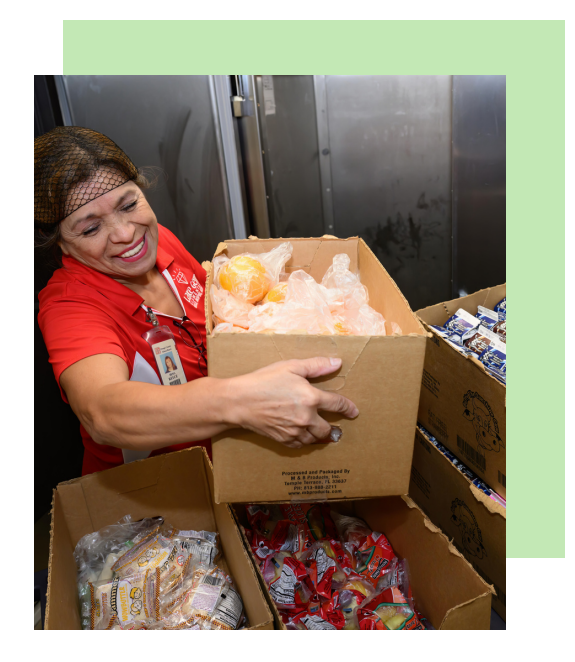
School food donation from Lake Gem Elementary school in Orlando, Florida