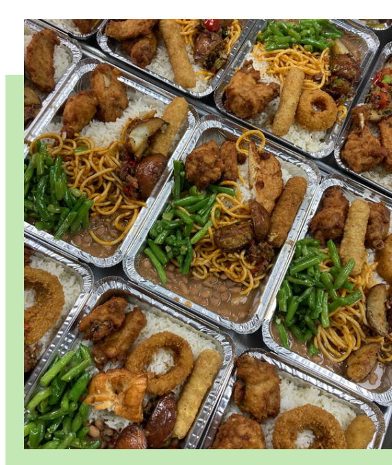
Donation of meals from Emporio Restaurante e Cafe in Long Branch, NJ