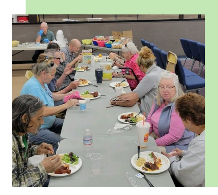
Folks eating meals at a homeless assistance pop-up at Freedom Foursquare Church in Portland

Since November, we have already provided 600 meals to nonprofits in Philadelphia and Oakland, and are ecstatic to continue organizing monthly events through 2024!