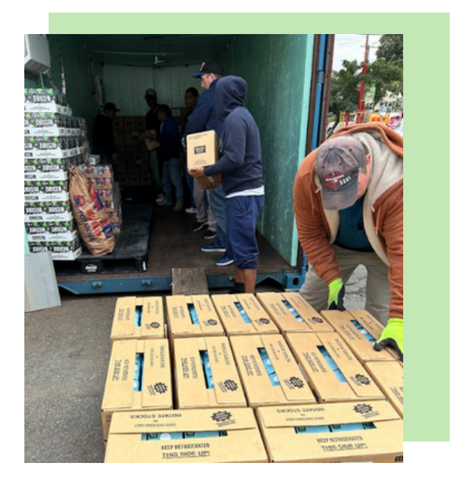
15 Pallets of juice donated to Providence Rescue Mission!